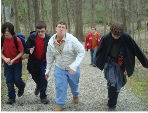
Hiking at Slate Run