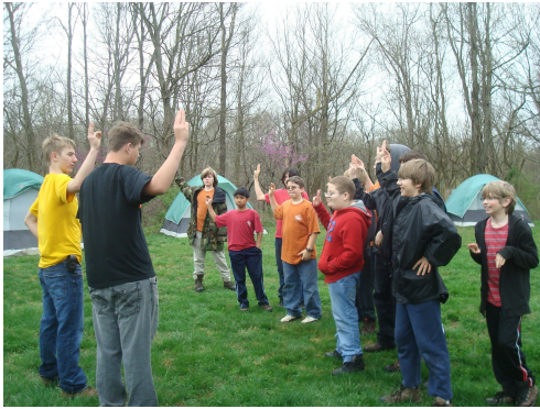
New scout campout flag ceremony